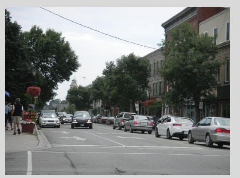
Example from Perth, Ontario

The public realm guidelines guide the improvement of Arnprior's streets, sidewalks and public spaces, ensuring that the pedestrian realm is safe, comfortable and attractive.