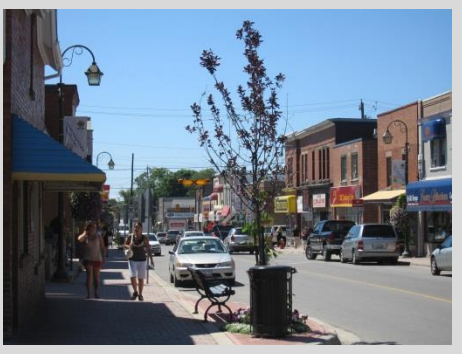
Example from Acton, Ontario

Streetscape elements should be consistent with the character of the street, and more generally, with Arnprior's historic character. Streetscape furniture which is designed to complement heritage buildings through the use of historic materials and colours is encouraged.