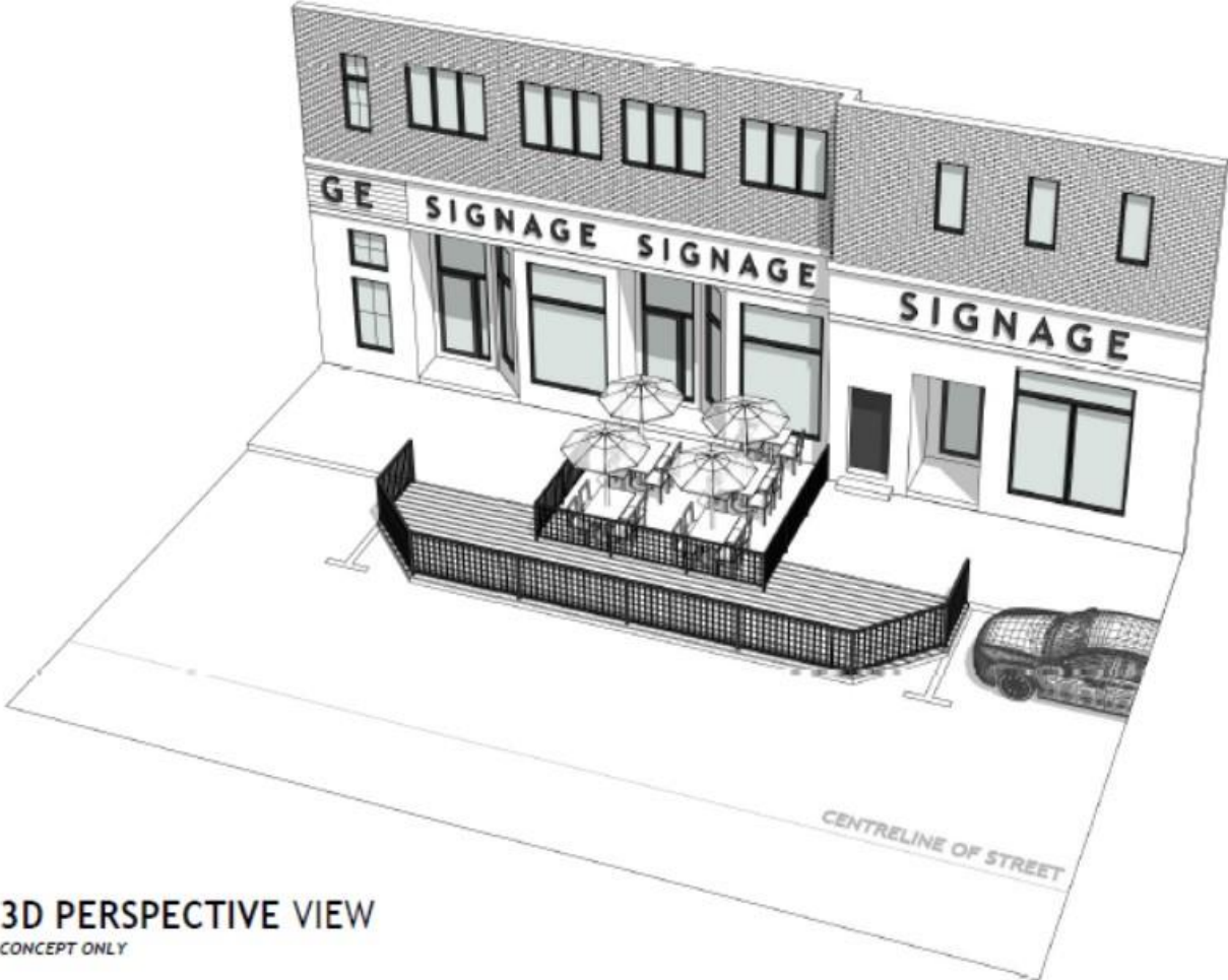
3D PERSPECTIVE VIEW